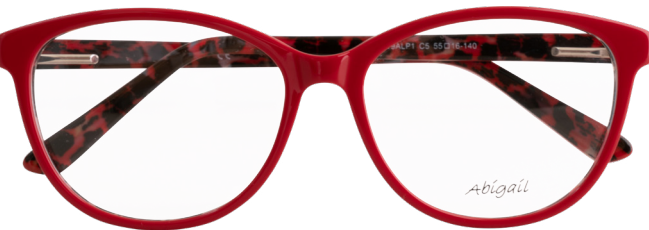
Abigail 19ALP1 $58