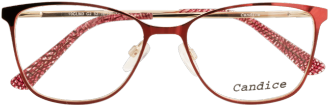
Candice 19CLM3 $58