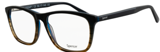
Spencer 19SMP1 $58