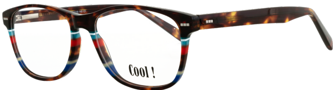
Cool 17CL6P $58