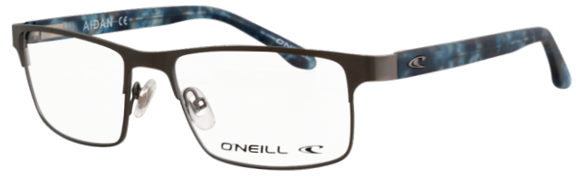
O'Neil Aidan $88