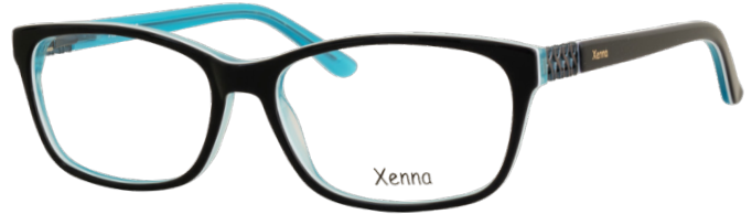
Xenna 17X1P $58