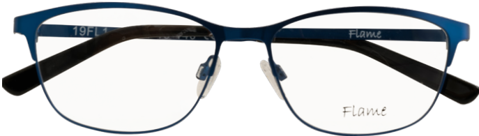
Flame 19FL1 $58