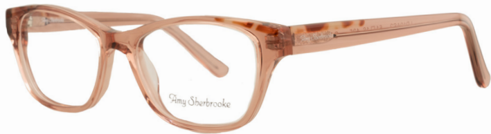
Amy Sherbrooke LP19AS2 $58