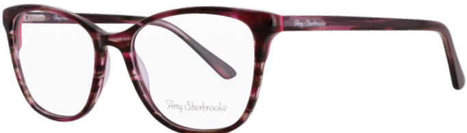
Amy Sherbrooke LP19AS3 $58