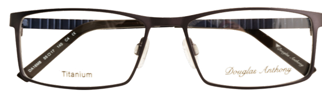
Douglas Anthony DA16M8 $88