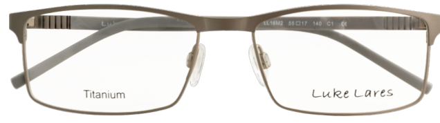
Luke Lares LL16M2 $88