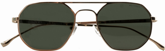
Bill Bass Prudence $58

*Prices shown are for frames only, available while stocks last. Prescription lenses available at additional cost.