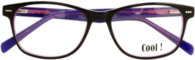
Cool 17CL5P $58

Below are some of our No or Low Gap range. Many more styles, colours and big brands available in-store.