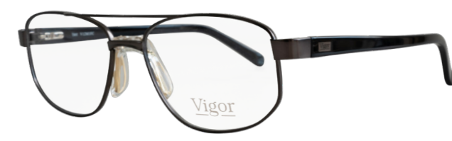
Vigor V12M1FC $58