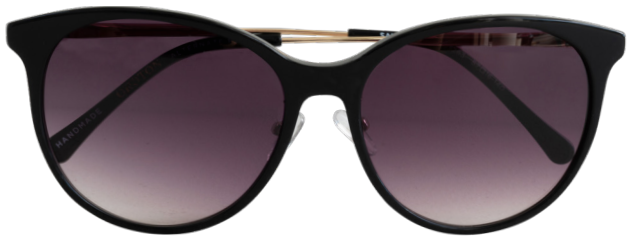
Oroton Saunter $88