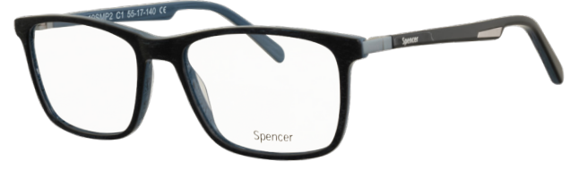
Spencer 19SMP2 $58