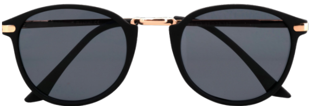
Rashel R19S1 $58