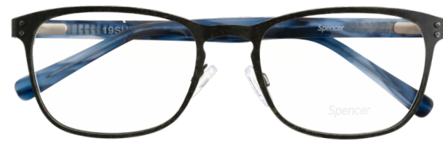
Spencer 19SUM1 $58

Below are some of our No or Low Gap range. Many more styles, colours and big brands available in-store.